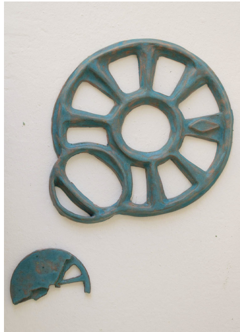
Artefacto #29, 2025, Glazed terracotta. © Courtesy Ana Franco Neto

The exhibition Apócrifos simultaneously summons the familiar and the mysterious, inhabiting a staged space that suggests an almost archaeological discovery