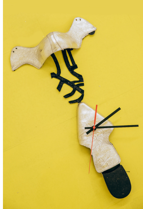
Dizzy Disco , 2024, Shoe and clock hands