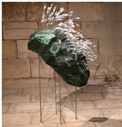
THE HILL, 2024, Daphne Klagkou. Glass flowers, carbon fibre, steel. 100 x 70 x 50 cm.

The various artworks embody these ideas, while fostering a dialogue between life and death, nature and human intervention, as well as identity, interconnected and tied to the passage of time. This way, the works exhibited in Hybrid Realities: Identity and Transition emphasize reflections about the importance of profoundly interconnected transitions, as part of a greater narrative, and of a hybrid existence.